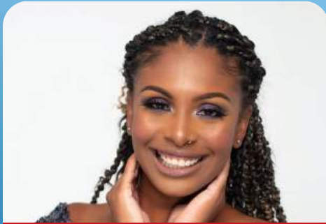
Something Mo - Onika Clickbait